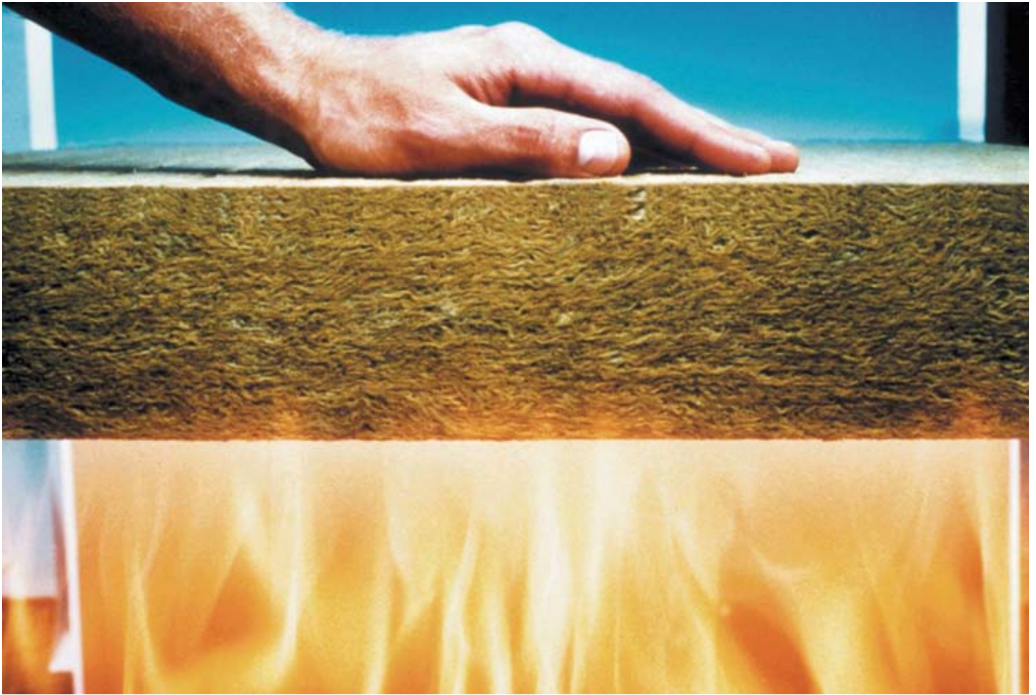
Fire-retardant properties of Rockwool stone wool