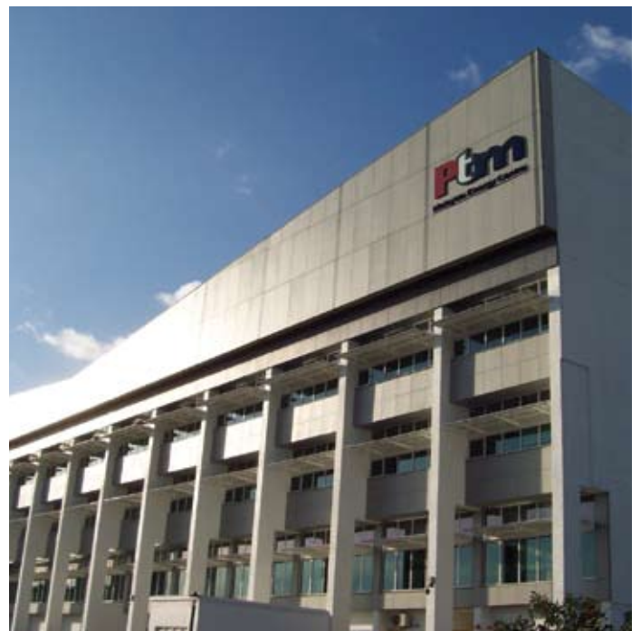
Malaysian Energy Centre Building, Bangi, Malaysia

of the fibres from the lungs. High-alumina, low-silica wool dissipates approximately 10 times faster from the lungs than traditional stone wool (Guldberg et al.; IARC Monograph).