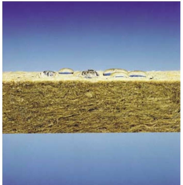
Water-repellent properties of Rockwool stone wool

Moisture and nutrients are necessary conditions for mould growth. Since more than 95% of Rockwool insulation products are made up of inorganic fibres, there is little nutrient source to allow fungal growth. Because of this and the product's water repellence, there is no need to add fungicide (Klamer et al.).