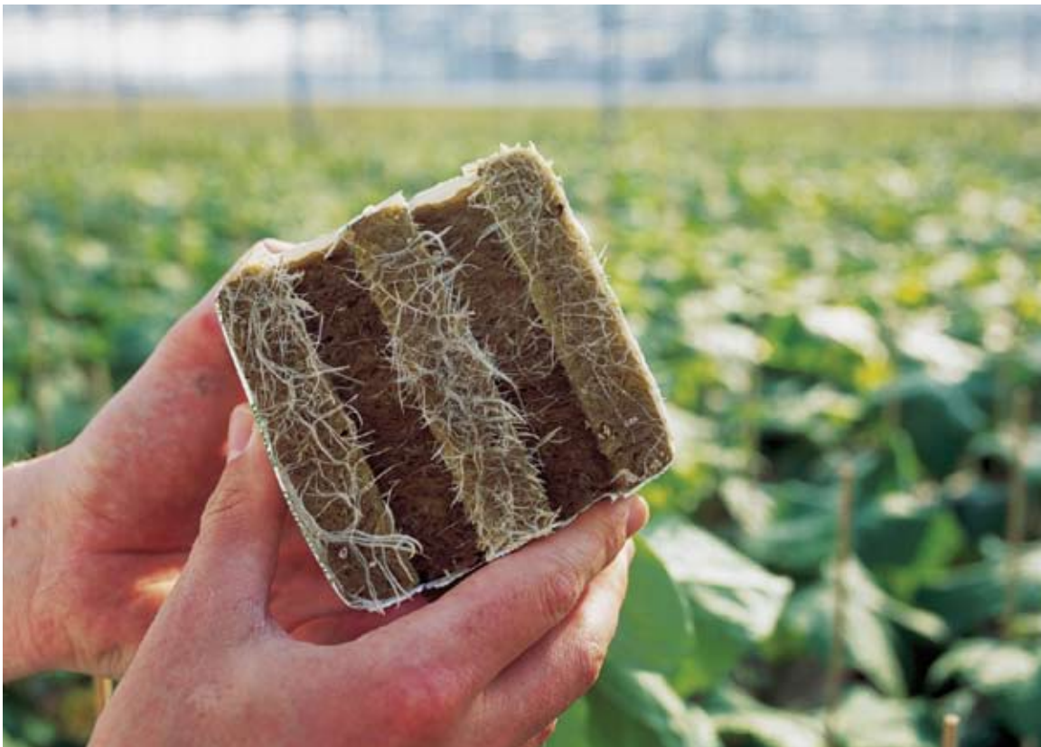
Greenhouse using Grodan® products for growing cucumbers

The Rockwool Group has approximately 8,000 employees in more than 30 countries – and customers all over the world. The group has been producing stone wool for more than 70 years and has currently 21 factories across Europe, North America and Asia (Climate & Environment).